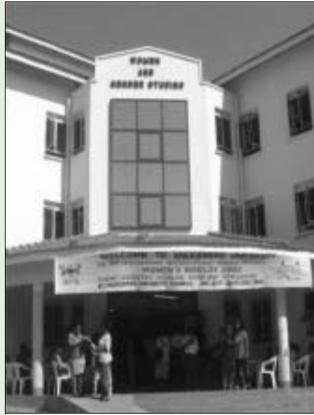
WOMEN AND GENDER STUDIES BUILDING, MAKERERE UNIVERSITY, KAMPALA, UGANDA

One of the highlights of the conference for me was the exhibition tent. The tent was filled with banners