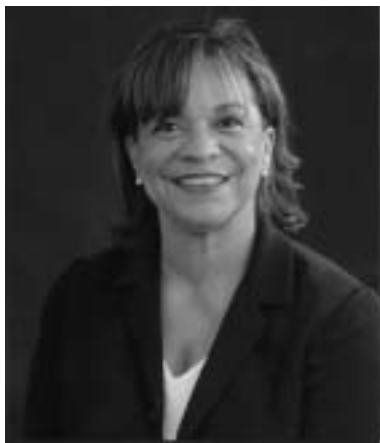
Ophir's Photography Studio