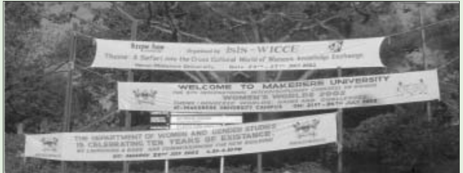
EIGHTH INTERNATIONAL INTERDISCIPLINARY CONGRESS ON WOMEN, KAMPALA, UGANDA

These thoughts frame my reflections of the conference I attended at Makerere University, Kampala, Uganda, this summer. The Eighth International Interdisciplinary Congress on Women, "Gendered Worlds: Gains and Challenges" drew 2500 women from around the world. The women came to talk about improving the lives of women and girls, children, and families. Sessions at the congress focused on health care, economic empowerment, schooling and education, law and human rights, peace and conflict, information and media, culture and creativity, science and technology, and activism and development. Conducted for the first time on the African continent, with women from all over