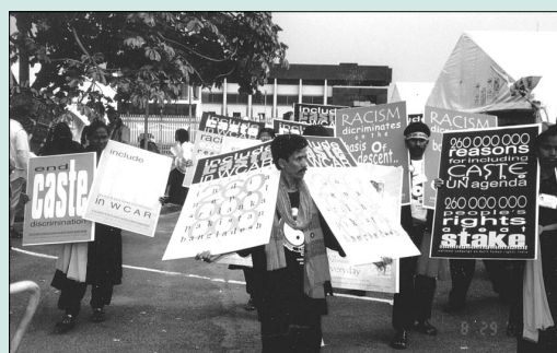
DALIT MARCHERS AT WCAR